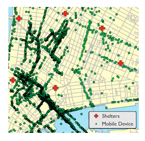
Figure 2. Notice the increased densities of mobiles phones approaching the Brooklyn Bridge in NYC.

When an evacuation order is issued, there are many questions that are spatial in nature: What impact has the incident had on transportation? What non-profit organizations are in the region and can they provide support? How many people can we safely evacuate? Understanding where people are located during an evacuation is a major challenge. The location of individuals is constantly changing and unpredictable. The allocation of resources is usually based on information that has been collected about the situation and the situational awareness of emergency planners. As shown in Figure 2, near real-time mobile location data can be used to increase the situational awareness of emergency personnel and to redirect resources as needed within their jurisdiction.