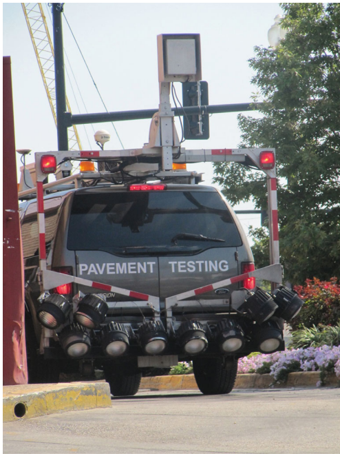
Fig. 3 Road assessment in Washington, DC